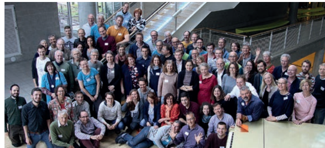
International Delegates Assembly 2019 in Stuttgart, Germany.